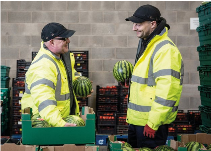
DEVELOPING The charity team form long-lasting friendships

After spending his early 20s bouncing between short prison sentences and supported accommodation he seized the opportunity for a steady job and a home of his own.