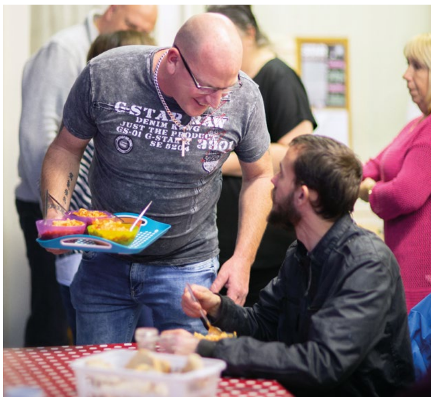
SUPPORTING Community groups use food as a way to engage and support people