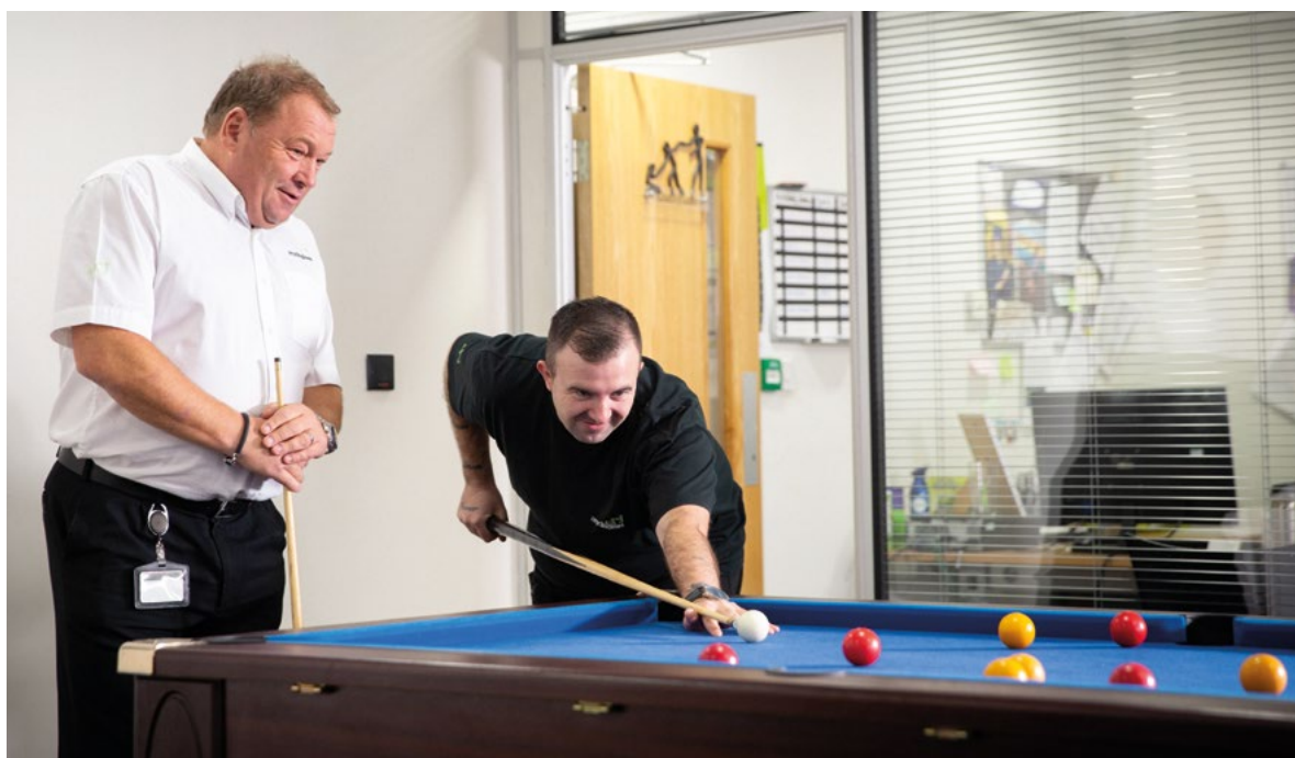
GUIDING Residents receive both personal and professional support