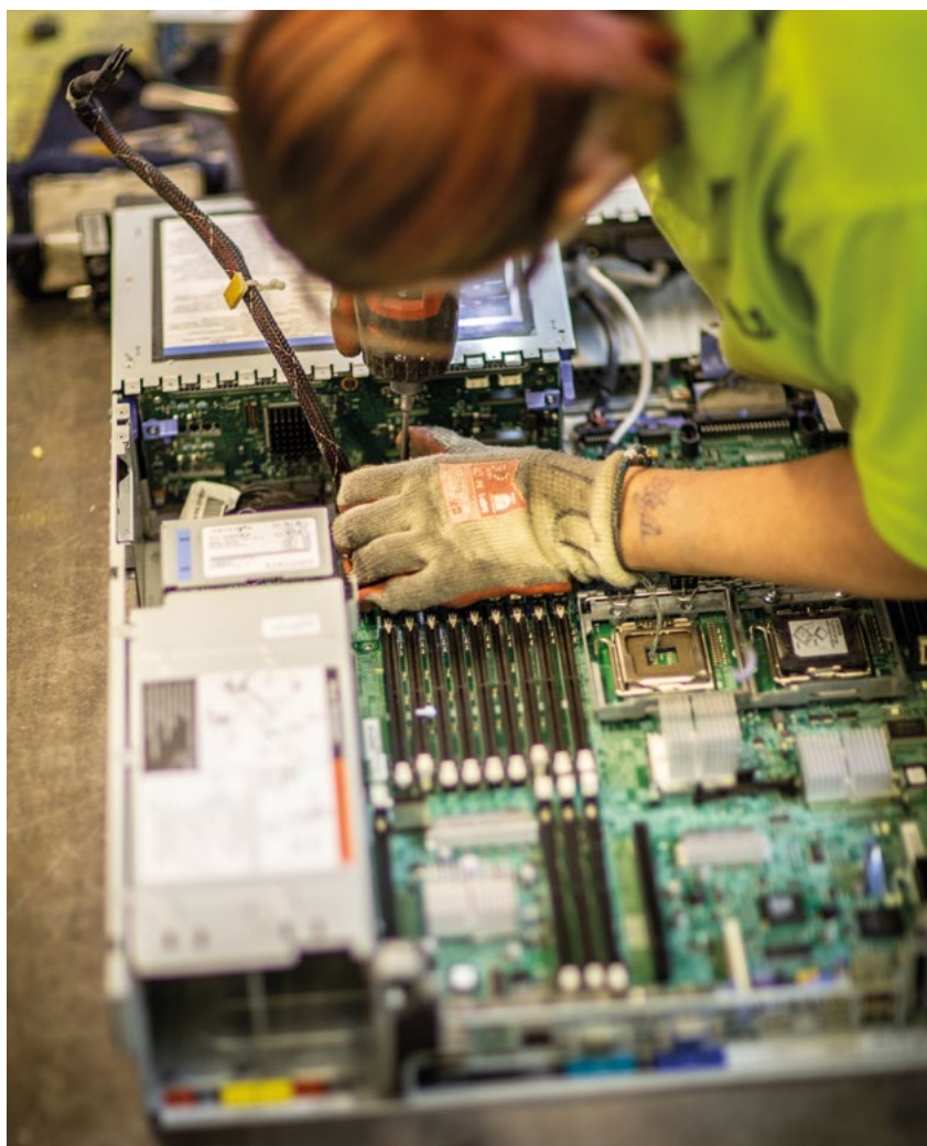
DISMANTLING Men and women develop skills while completing meaningful recycling work

with Recycling Lives or partner businesses across the UK, meeting the experience, capabilities and ambitions of all.