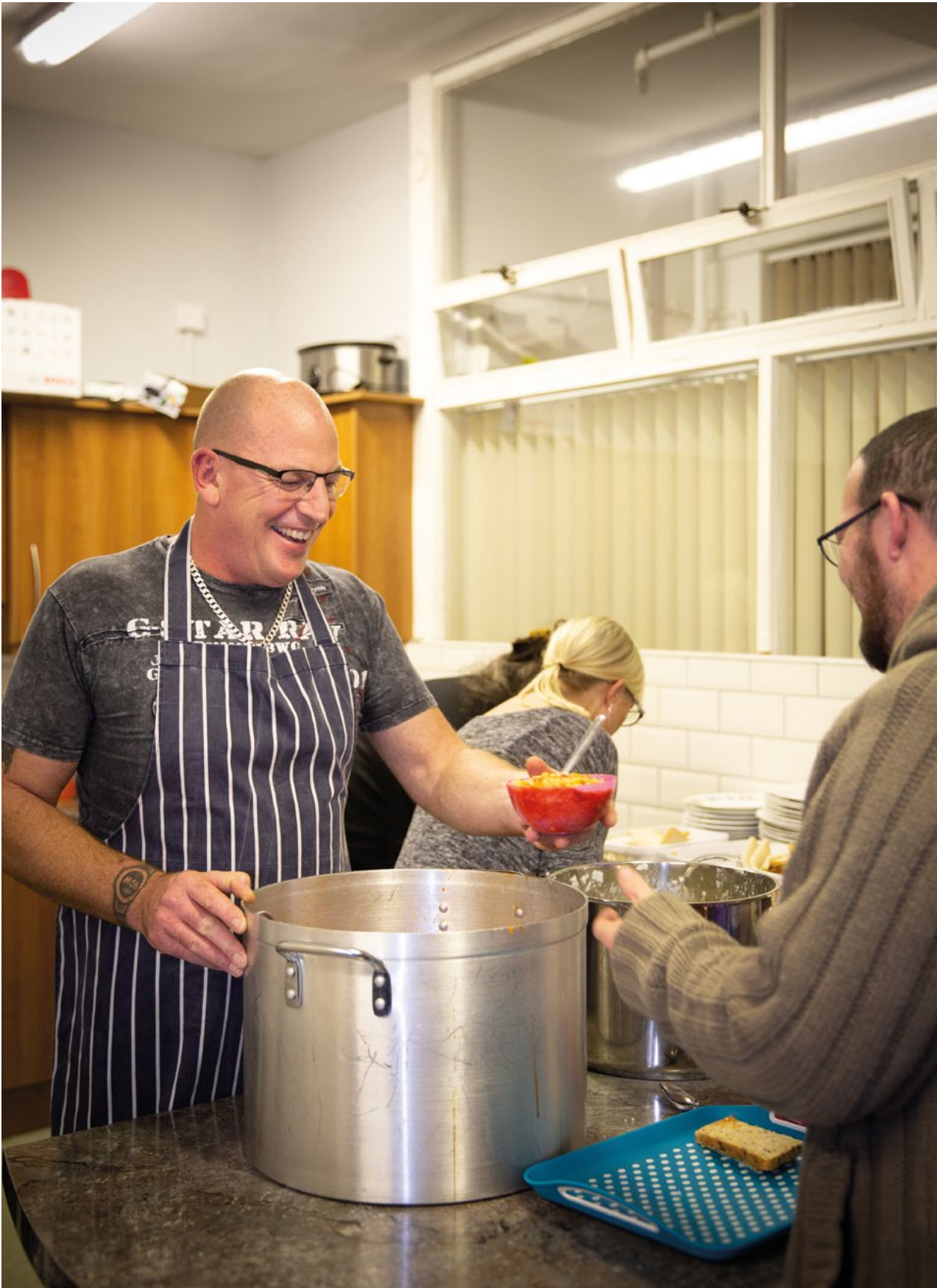
SERVING Volunteers serve meals for vulnerable communities