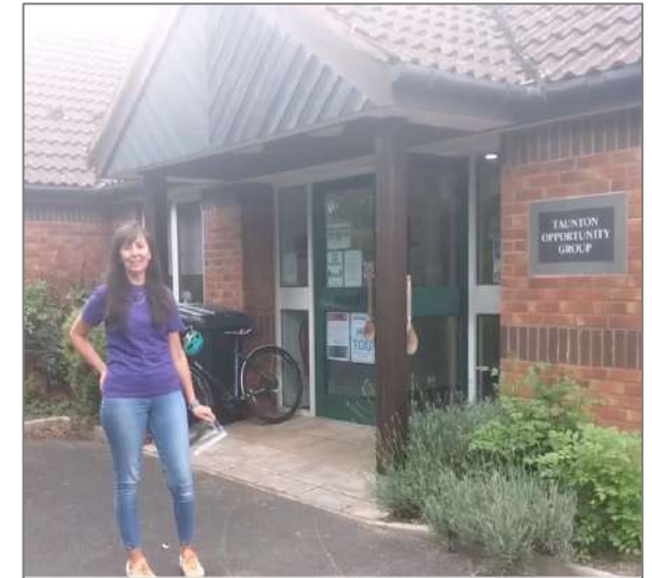
Taunton Opportunity Group