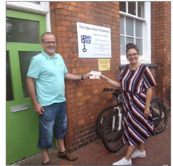
Taunton Open Door