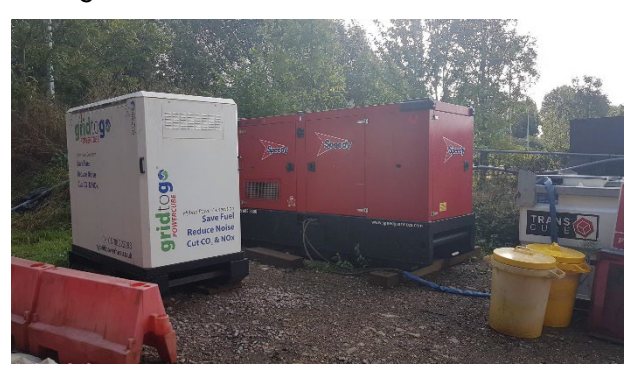
Figure 3 – Generator and Battery Bank

Generator and Battery Bank - Moving into Phase 2, an analysis of the data led to the retention of the solar panels and the addition of an energy efficient 10kW generator linked to a 50kW battery bank to store excess power. This was beneficial as during low demand the stored power could run the lighting, security cameras, small hand tools and welding equipment. The banks also compensated for power surges which enabled use of a smaller generator. Careful planning by the site team reduced fuel demand from 5,000 litres/week in Phase 1 to just 1,000 litres/week in Phase 2. A huge 80% saving.