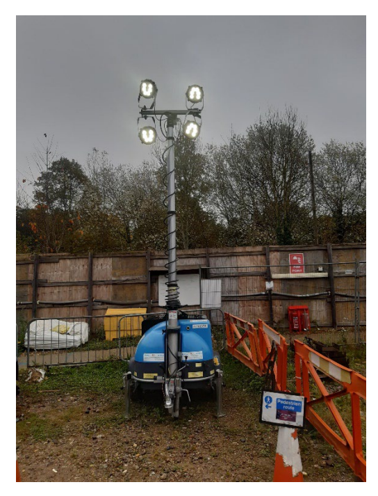
Figure 4 - Ecolite-TH200 Lighting Tower

Hydrogen Lighting – Lighting is a major requirement for the works. By introducing mobile Ecolite-TH200 Lighting Towers, which integrate low energy LED lights with hydrogen fuel cells, there have been benefits. The fuel cell mixes hydrogen with air to create electricity, water, and heat, which means the towers are virtually silent and emit no carbon or particulates.