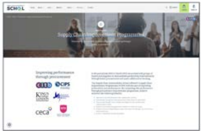
Click above to visit the Supply Chain Improvement Programmes webpage