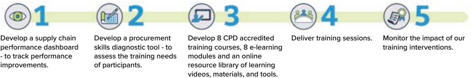
Figure: Contract Deliverables

The targeted measurable productivity improvements in performance were £5 million, but through programme delivery this was significantly exceeded with savings and cost avoidance totalling £7,450,943 .